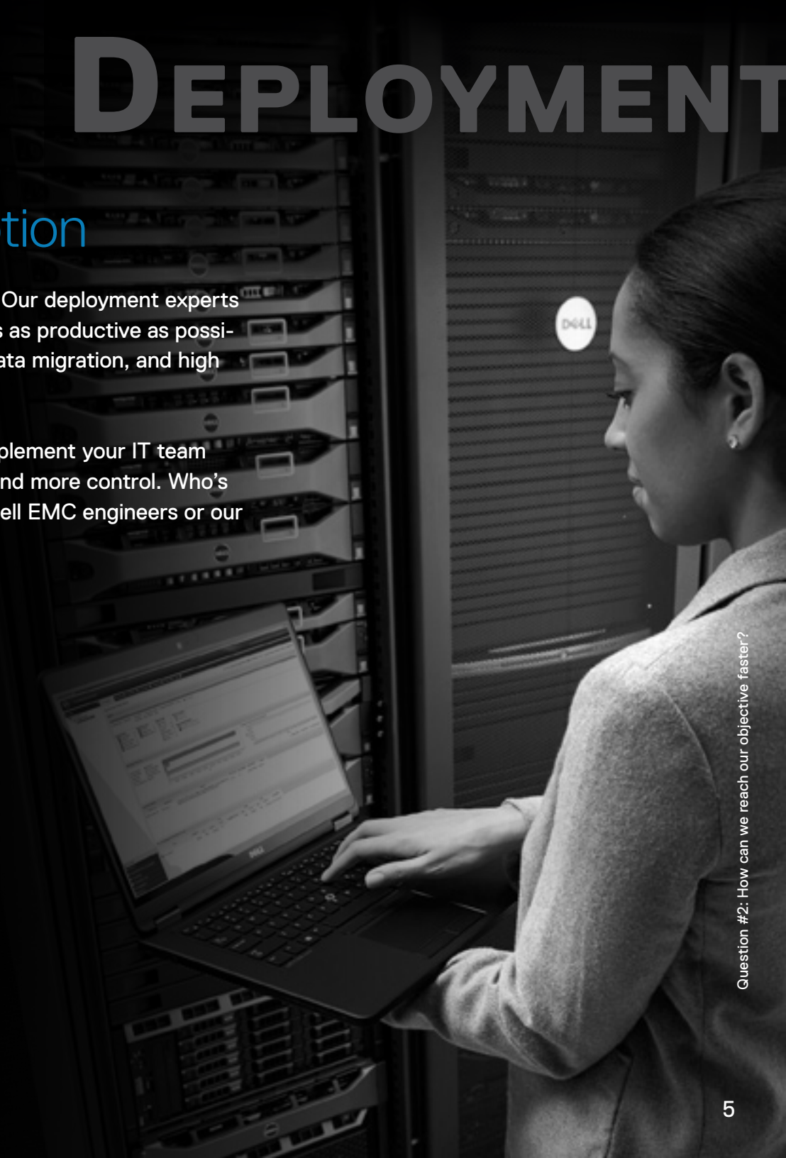
Question #2: How can we reach our objective faster?